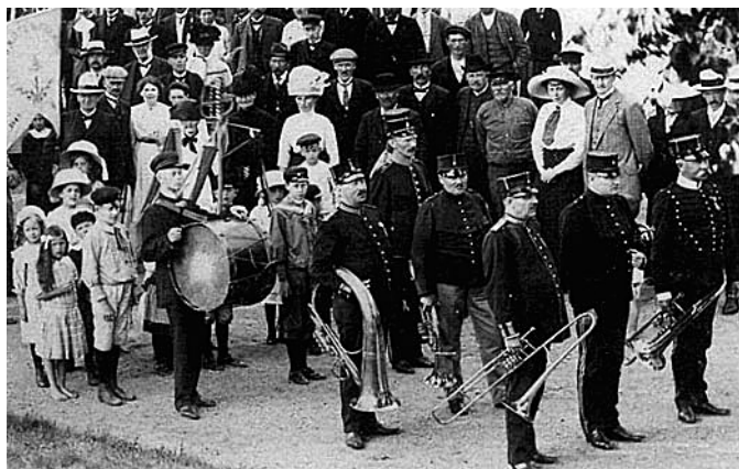
Medevi Brunnsorkester 1912. "Grötlunk" in military uniform. Normally the ensemble dressed as civilians.

Around 1850 the music at Medevi was provided by visiting military bands but in 1870 Medevi Brunnsorkester (spa orchestra) was founded. Medevi spa hired a bandleader who gathered musicians from different military bands who formed the ensemble for the summer spa season.